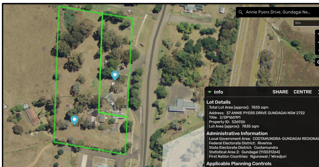
Figure 2 Close Up View of Existing Premises

Figure 2 below provides a close-up view of the development site and site landscape.