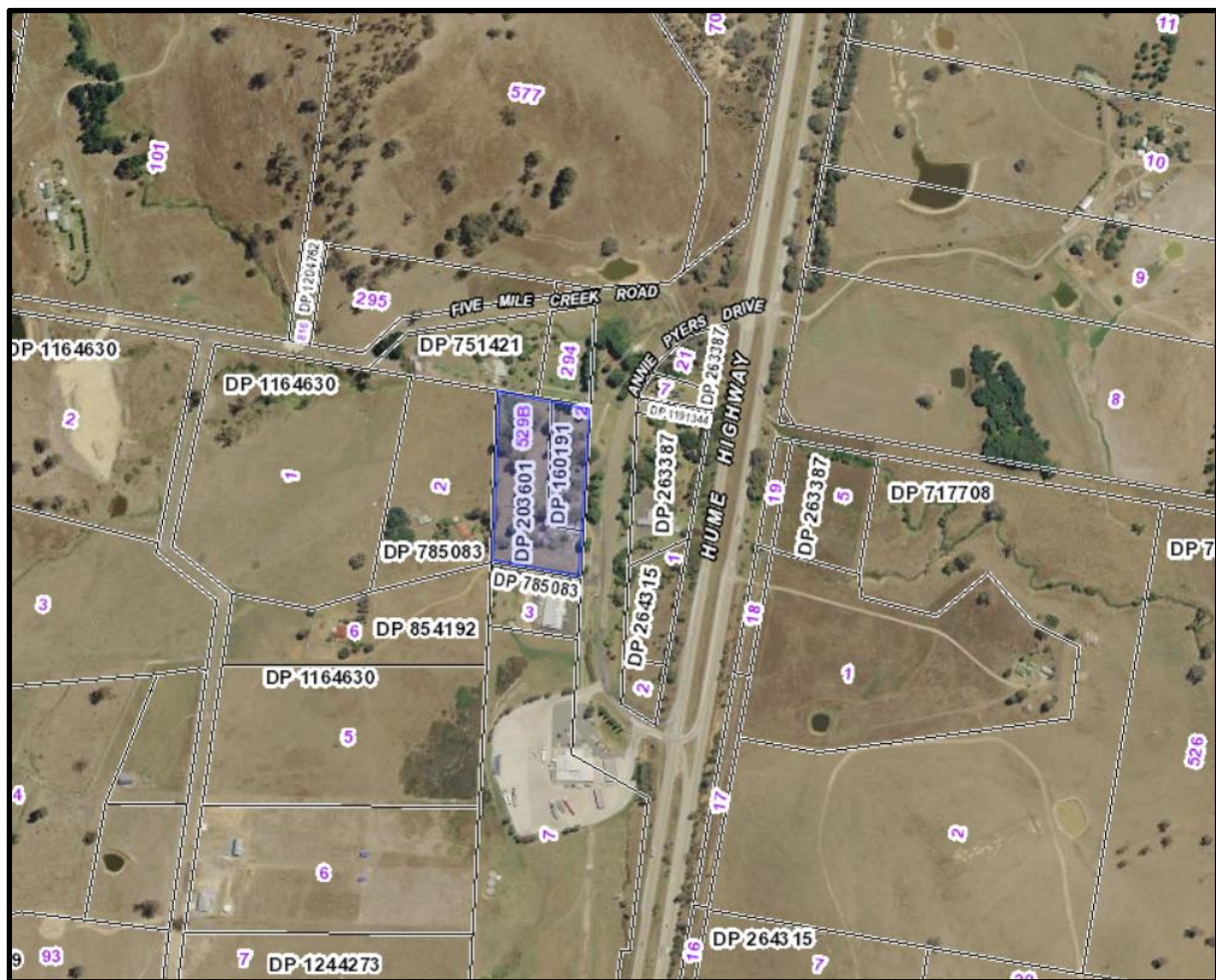
Figure 1 Aerial Image of the development site and surrounds

The land uses now referenced within this report are as now characterized as future Food and Drink Premises, future Retail, and future Pub uses.