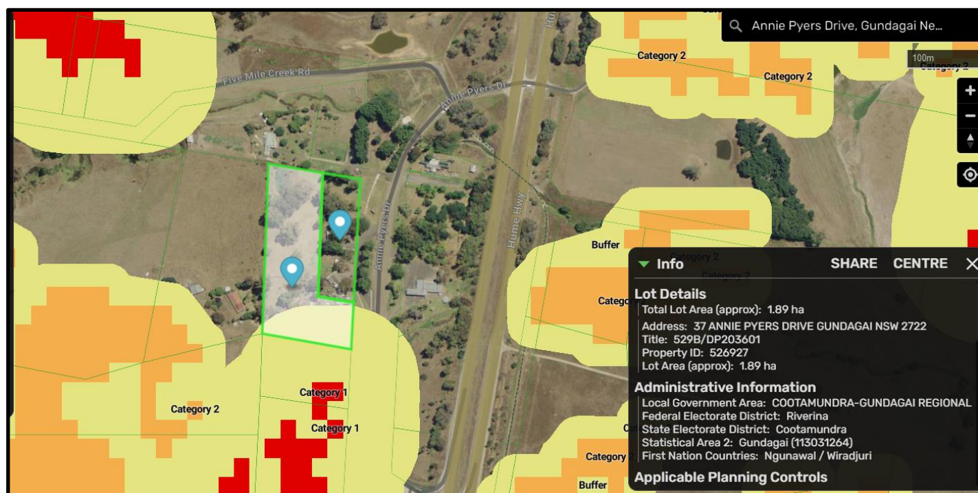
Figure 3 NSW Bush Fire Prone Land Map

Refer to figure 3 below, identifying bushfire prone land mapping extent for the site.